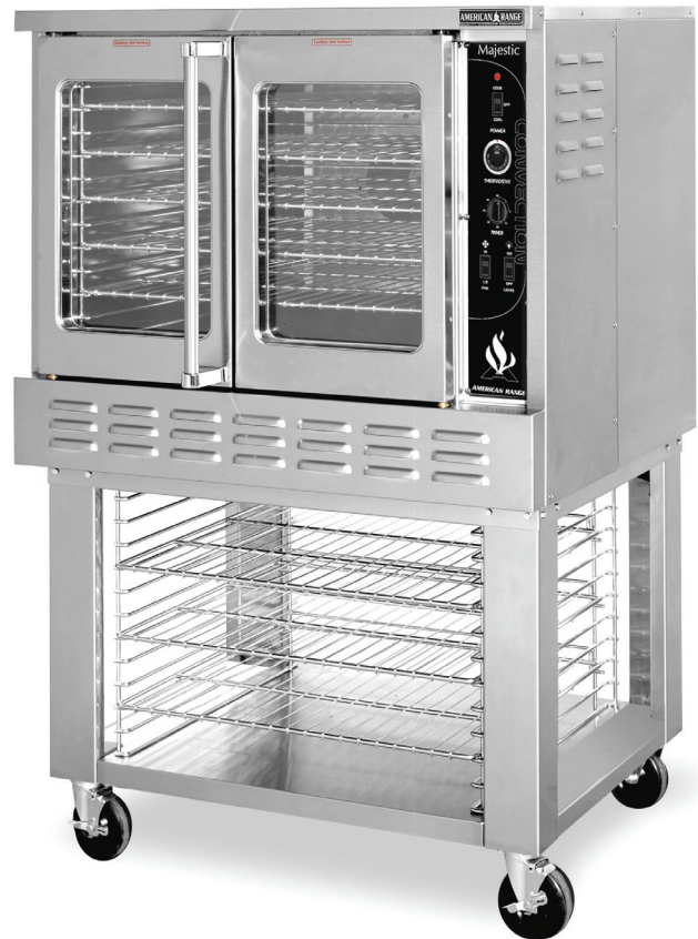
Shown with optional glass door & computerized control